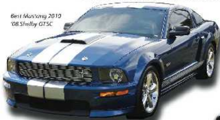
Best Mustang 2010 '08 Shelby GTSC

Proceeds from this event will be donated to Shriners Hospitals for Children™