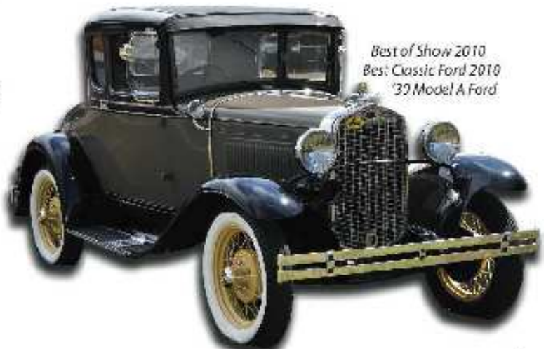
Best of Show 2010 Best Classic Ford 2010 '32 Model A Ford